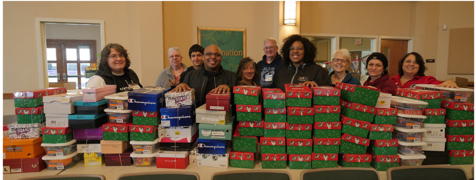
▲ Thanks to an effort led by Quest Student Ministries and supported by its faithful volunteers, shoeboxes are packed and ready to be shipped as part of the Operation Christmas Child project.

Numbers are as of December 31, 2018 and are subject to change based on revisions made by donors. The 4RS Commitment Period ends April 2019. To learn about the projects the 4RS funds will support, visit ChristChurchUSA.org/4RStudents .