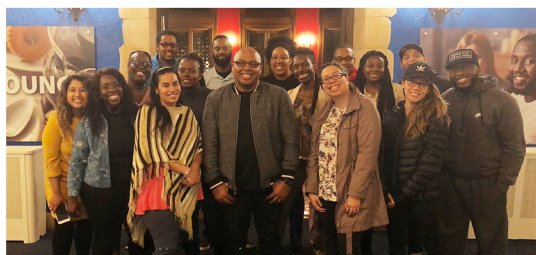
▲ Quest Young Adults gather outside the new Q Lounge at the East Campus during an evening of fun, fellowship, and real-talk discussions on how they can effectively lead and serve within their own generation.

New Jersey! At both campuses, students met snakes both small and very large, a baby alligator, a chinchilla, tarantula, and many more amazing creatures while connecting them to a personal, creative God. Likewise, during our Mad Science experience, our students gained an appreciation for science through some crazy experiments including dry ice, fire, and even wind—but they also learned that God is the creator of the science we learn about and see every day in our lives!