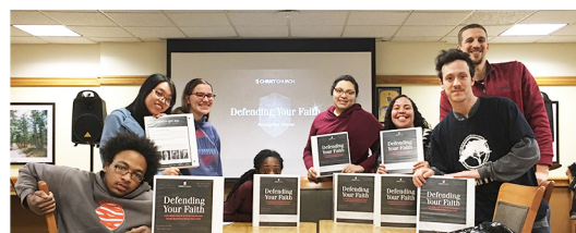
▲ Students at William Paterson University, above, are learning about apologetics at a critical time in their lives.